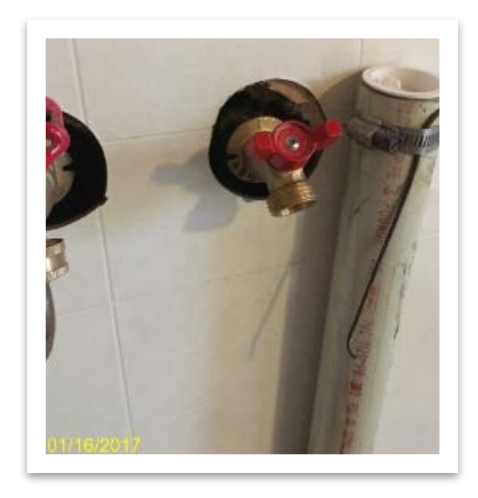
Shut off valve is shown repaired. Capping is now required.