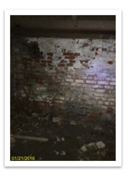
Unfinished basement wall unless further damage will result if left untreated.