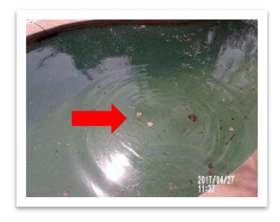
Acceptable after photo showing placement of the mosquito prevention product prior to installing a pool cover.