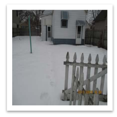
Expectation: Snow removal must be performed.