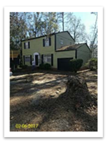
Examples of Proper Marking of Tree for Tree Removal