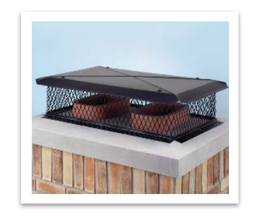
Example of one Chimney Cap Allowable used to cover a single flue.