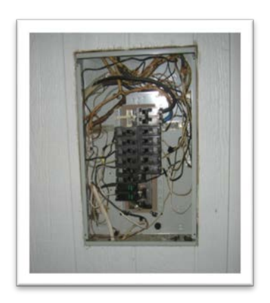
Replace missing exterior electric panels with proper covers.