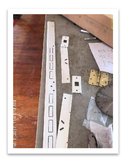
Photo showing door jamb and hinge protection product materials ready for installation.