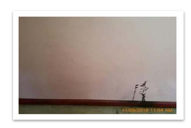
Dirty walls, smoker stains, and scuff marks.