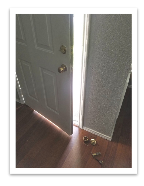
Photo shows completed lock change, however old lockset must be placed in a kitchen drawer. Do not leave on the ground.