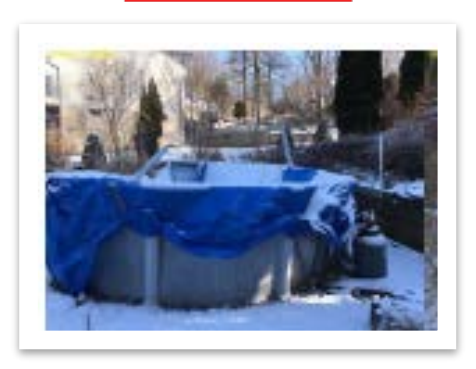
Pool cover is collapsing and pool is unsecured.