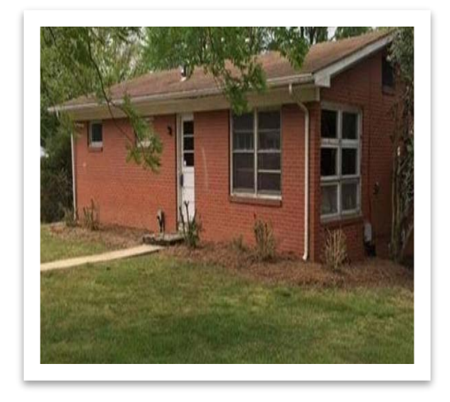
Shrubs pruned to unacceptable height causing damage to the landscaping. This is not acceptable.