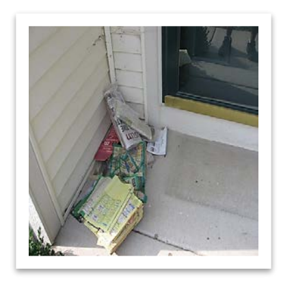
Examples of Before and After Yard Services