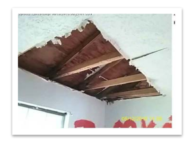
Removal of drywall and insulation.