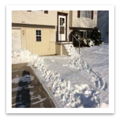
Expectation: Snow must not be pushed to garage and all paths and steps must be cleared.