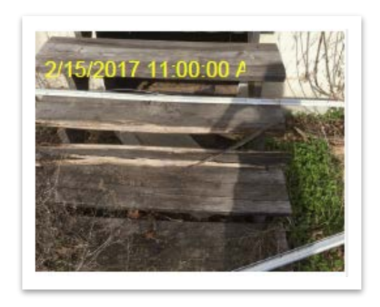
Damaged treads and risers.