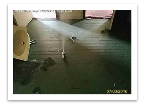
Proper use of Extermination Allowable showing flea bomb in use.