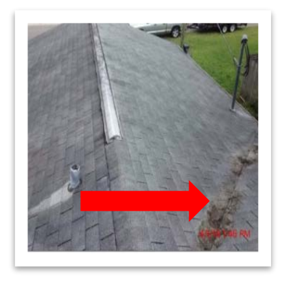
If roof damage is discovered after performing roof cleaning services, assess the condition and utilize the Roof Patch / Repair Allowable, if necessary.