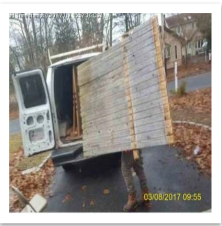
Examples of Deficient Fence Repair