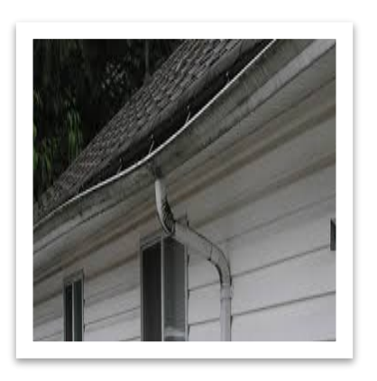
Section of gutter needs repair.