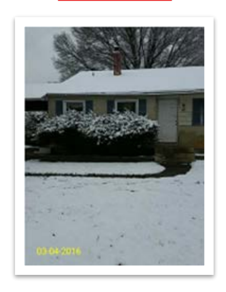
Shrubs properly trimmed off of the structure, however the shrubs must also be pruned to acceptable height.