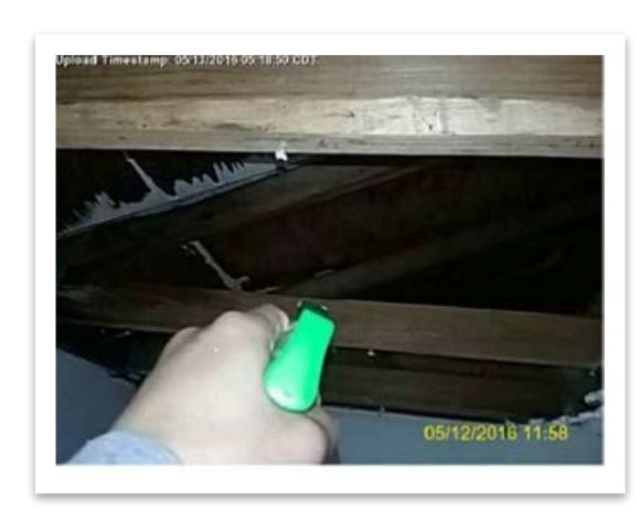
Treatment of studs with anti-microbial solution.