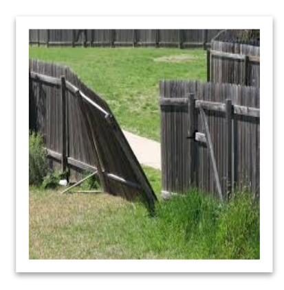
Use the Fence Repair Allowable to re-secure fencing or replace missing panels.