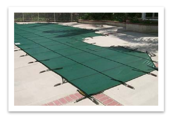
In-ground Pool: Covered correctly.