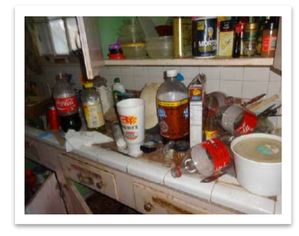
Raw garbage/perishables must be removed.