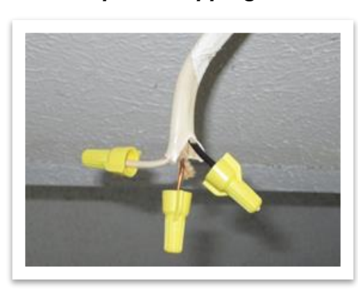
Example of Capping Wires