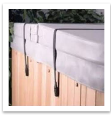
Spa already covered. There is no further action to secure the pool. Ensure any debris on the cover is removed.