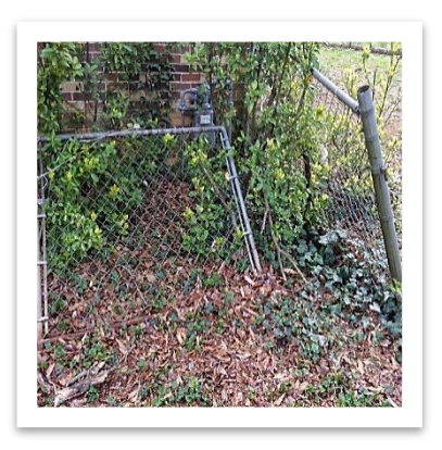
Use the Fence Repair Allowable to re-secure fencing