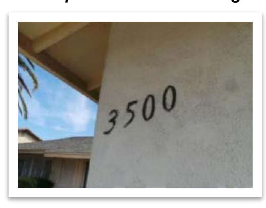
Example of Deficient Address Posting