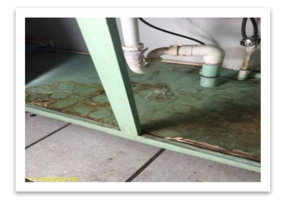
Chemical residue left under a sink.