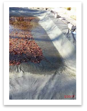
Use of cinder blocks is not a property way to secure a pool cover.