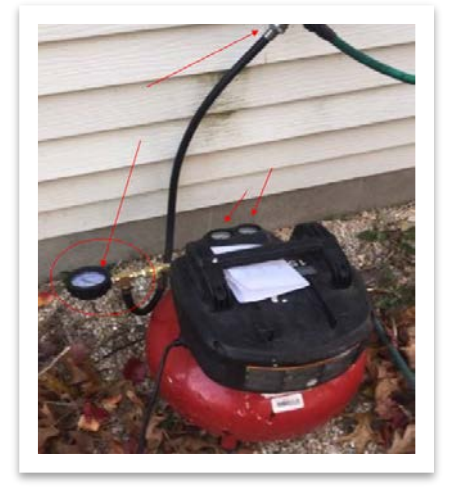
Air compressor with gauges connected to system in order to confirm system is holding pressure.