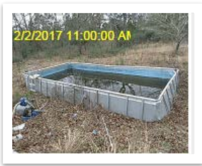
Pool must be drained and dismantled.