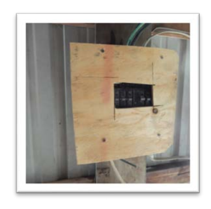
Replace missing exterior electric panels with proper cover. Plywood or clear board is not acceptable.