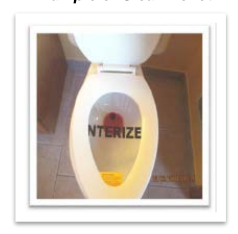
Properly cleaned and winterized toilet.