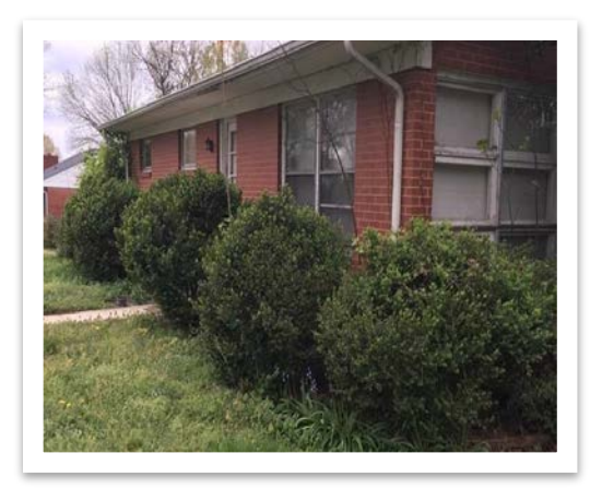
Expectation: Shrubs must be pruned to acceptable height.