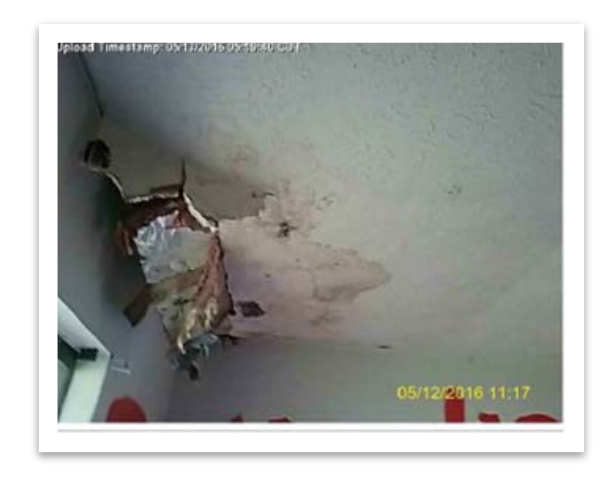
Discovery of discoloration.