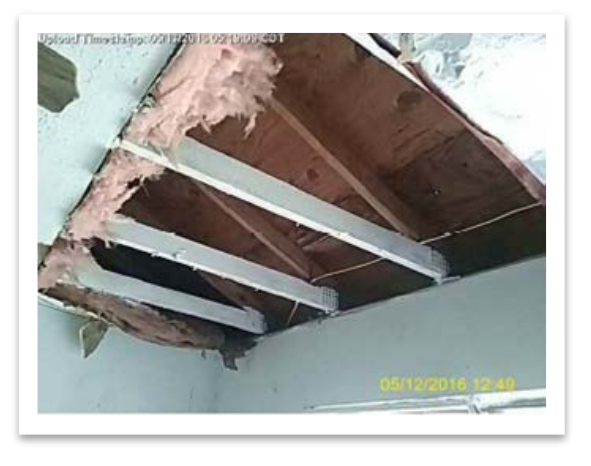
Treatment of studs with stain blocking primer.