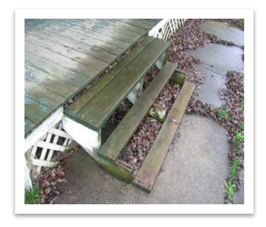
Damaged/missing treads and risers.