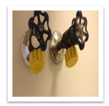
Proper capping of water lines.

© 2017 Fannie Mae. Trademarks of Fannie Mae.