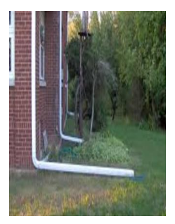
This is an example of an excessive extension. The extension should be cut to the appropriate length