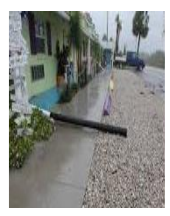
This is an example of a trip hazard being created by installing the downspout extension

A vendor should never install a downspout extension that would interfere with an egress (window well), create a trip hazard, impede a walkway or driveway.