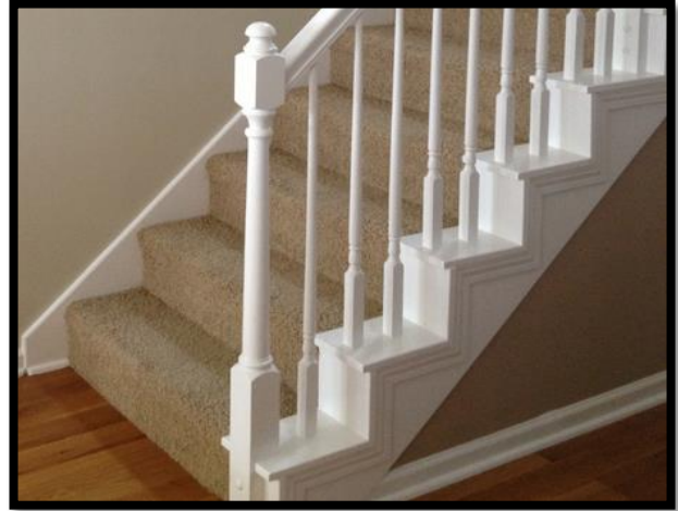
Handrail with Newel Post and Balusters