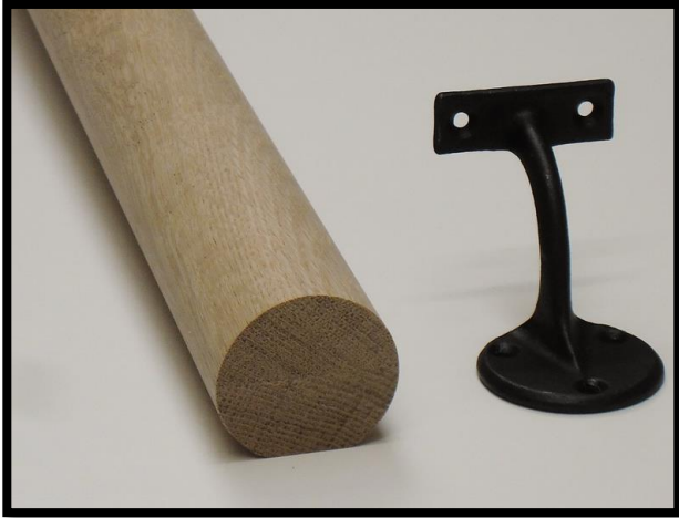
Handrail with Mounting Bracket