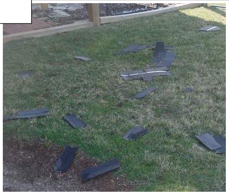
Damaged Shingles on Ground

When removing items considered trash, be sure to take clear pictures of the items to justify the removal.