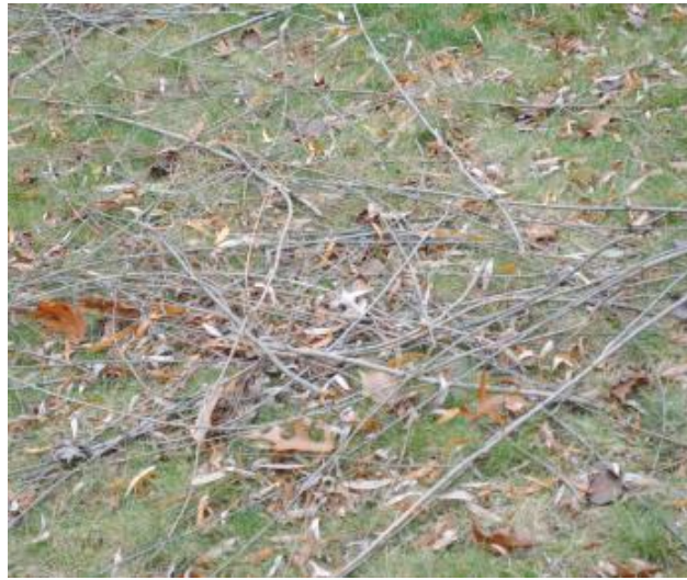
Sticks throughout Yard

These photos represent Natural Yard trash on site that has no value and can be removed in most cases. Any natural items removed would need to be removed as cubic yards and documented as such.