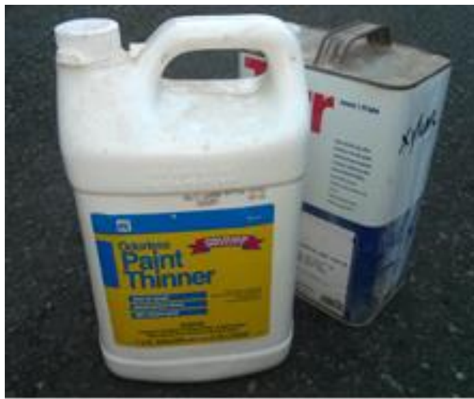
Flammable Paint Thinner

These above photos represent items that are considered Health Hazards.