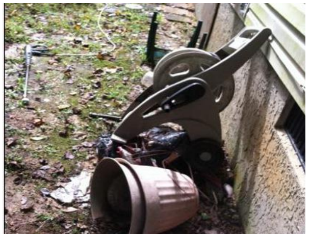
Garden Hose Spindle and Planters

These photos represent Personal Property found on site. Although these items appear to be used, worn, and neglected, they still remain usable and would have a garage sale value. Consequently, these items should NOT be removed from the property. unless approved by client.