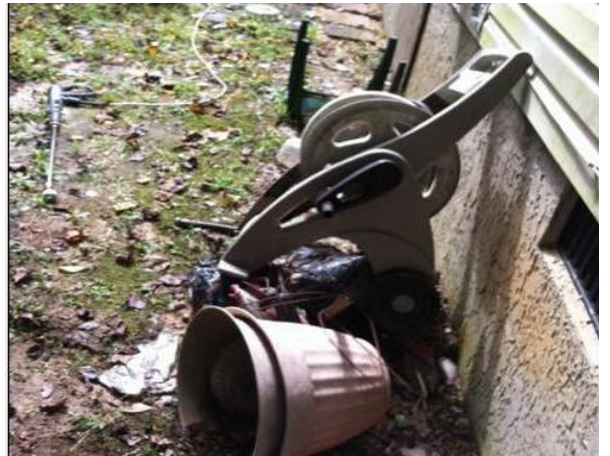
Garden Hose Spindle and Planters

These photos represent Personal Property found on site. Although these items appear to be used, worn, and neglected, they still remain usable and would have a garage sale value. Consequently, these items should NOT be removed from the property. unless approved by client.