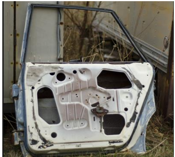
Detached Car Door

Although we would be unable to remove these personal property items from the dwelling as trash, we would still be expected to consolidate these objects to a location to avoid unnecessary neighborhood blight.