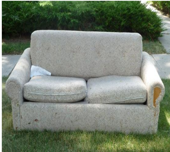
Couch in Front Yard

Although we would be unable to remove these personal property items from the dwelling as trash, we would still be expected to consolidate these objects to a location to avoid unnecessary neighborhood blight.