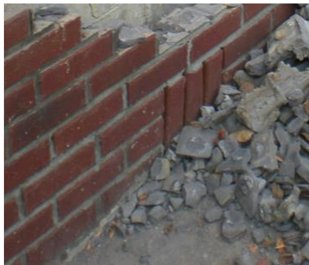
Crumbling Decorative Brick