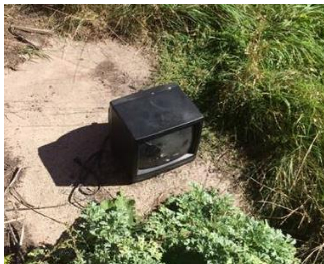
TV with Broken Glass