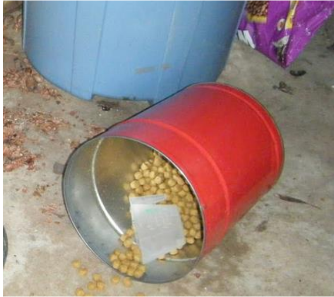
Open Dog Food is an Infestation Risk

Always be careful when handling any items being removed as health hazards. You should always be wearing proper clothing, gloves, and eyewear when possible.