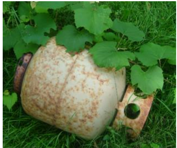
Old Propane Tank

The broken glass is dangerous to touch and the paint containers are flammable. As a reminder, removal and proper disposal of toxic materials are subject to local ordinance.