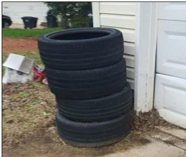
Set of 4 Tires