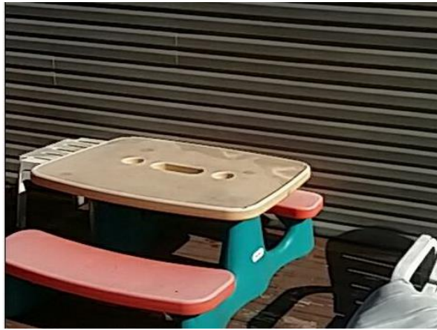
Child's Picnic Table

These photos represent Personal Property found on site. Although these items appear to be used, worn, and neglected, they still remain usable and would have a garage sale value. Consequently, these items should NOT be removed from the property. unless approved by client.