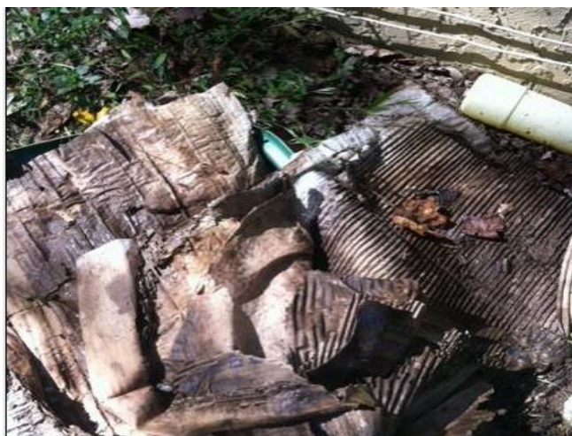
Rotting Cardboard Boxes