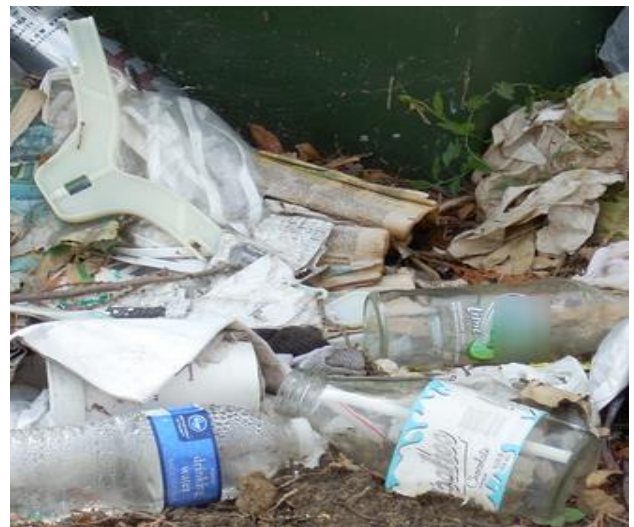
Empty Bottles and Broken Hanger

These photos represent Garbage on site that although was once usable, maintains no value and has been discarded. These items would be subject to an allowable to remove exterior trash to eliminate blight.