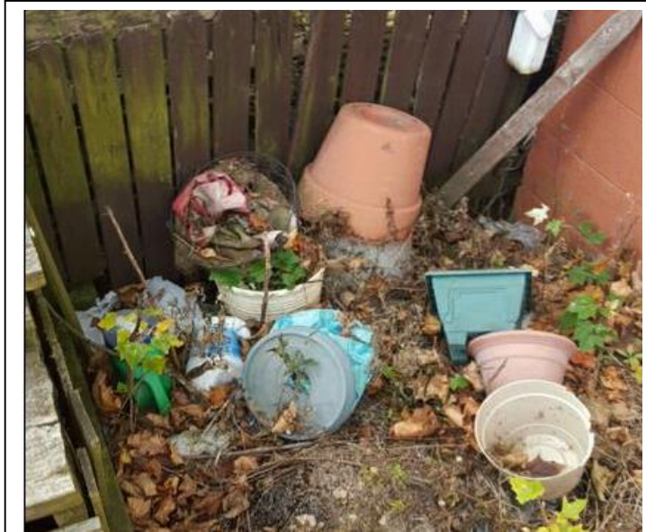
Broken Containers and Grocery Bags

These photos represent Garbage on site that although was once usable, maintains no value and has been discarded. These items would be subject to an allowable to remove exterior trash to eliminate blight.