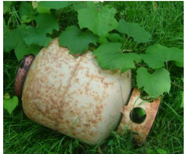
Old Propane Tank

The broken glass is dangerous to touch and the paint containers are flammable. As a reminder, removal and proper disposal of toxic materials are subject to local ordinance.