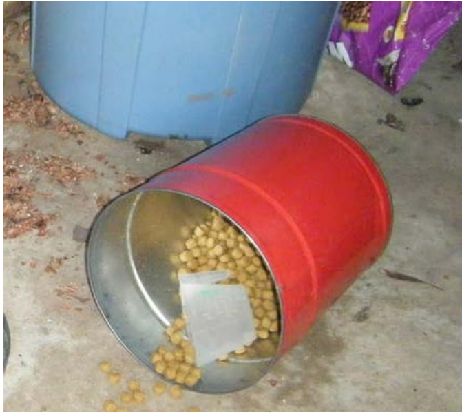
Open Dog Food is an Infestation Risk

Always be careful when handling any items being removed as health hazards. You should always be wearing proper clothing, gloves, and eyewear when possible.