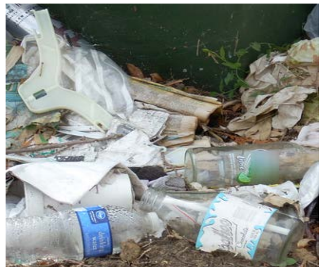
Empty Bottles and Broken Hanger

These photos represent Garbage on site that although was once usable, maintains no value and has been discarded. These items would be subject to an allowable to remove exterior trash to eliminate blight.