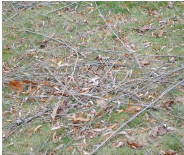
Sticks throughout Yard

These photos represent Natural Yard trash on site that has no value and can be removed in most cases. Any natural items removed would need to be removed as cubic yards and documented as such.