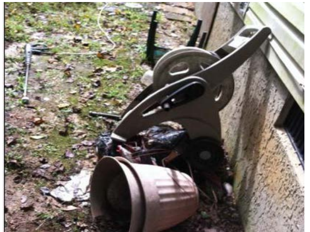
Garden Hose Spindle and Planters

These photos represent Personal Property found on site. Although these items appear to be used, worn, and neglected, they still remain usable and would have a garage sale value. Consequently, these items should NOT be removed from the property. unless approved by client.