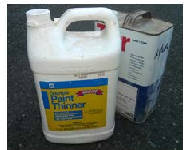
Flammable Paint Thinner

These above photos represent items that are considered Health Hazards.