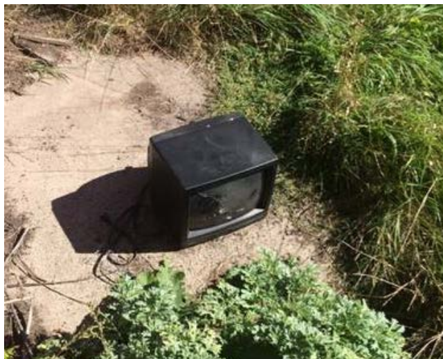
TV with Broken Glass