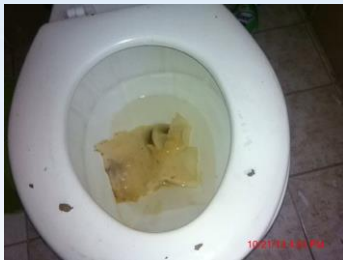
An example of a before, during and after of a toilet.