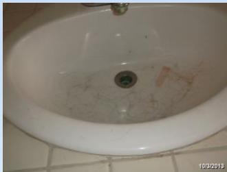
Sink before, during and after.

All fixtures regardless of appearance must be cleaned. Sometimes using chemicals such as Simple Green or CLR are necessary when cleaning areas of the bathroom. Fixtures sometimes get calcium stains/deposits, they must be cleaned properly.