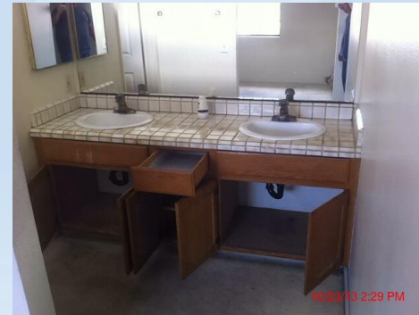
Same bathroom after a good cleaning.