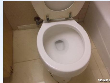
Toilet base, bowl and under all the seats are now clean.