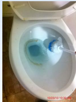
Toilets may sometimes need to be pre-soaked. If they don't a good toilet cleaner and brush should do the trick.