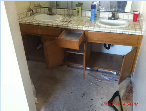
Bathroom counter and cabinets before.

For the toilet, be sure to remove any large items in it. Don't try to flush it down as it may lead to further damage. Also, be sure to clean under the seats and around the base.